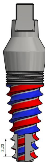
DOBLE ESPIRA PASO 2.